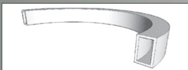
R.H.S Rectangular Hollow Section ON FLAT