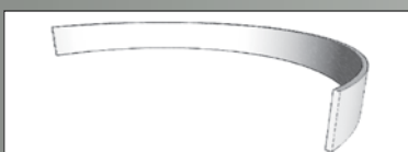
FLAT BAR ON FLAT

The rolling diameter can be limited by the thickness/weight of each section. For further information inquire within.