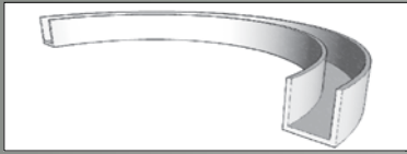
P.F.C Parallel Flange Channel ON EDGE