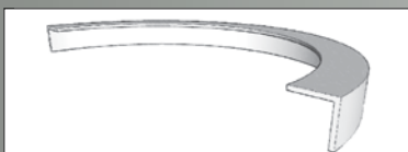
ANGLE TOE IN