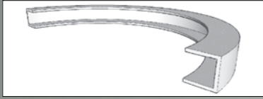
P.F.C Parallel Flange Channel TOE IN