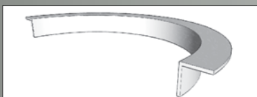
ANGLE TOE OUT