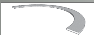
FLAT BAR ON EDGE