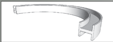
U.B Universal Beams ON EDGE