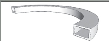
R.H.S Rectangular Hollow Section ON EDGE